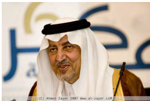
Saudi Minister of Education, Prince Khalid al-Faisal

several of his predecessors. 61 When the minister he replaced was appointed in 2009, the New York Times wrote in an editorial that, “he also is the king’s son-in-law, so there can be no more excuses if Saudi textbooks continue to spew hateful views of non-Muslims.” 62