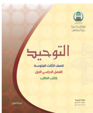
Ninth grade religious studies textbook on monotheism for 2011-2012