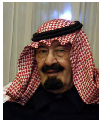
King Abdullah bin Abdul Aziz of Saudi Arabia

We have toned them down.” 24 The Kingdom’s foreign minister, Prince Saud al-Faisal, claimed, “we have gone through a whole program of going into the educational system from top to bottom, from schools, teachers, books, and we have taken everything out of them that does not call for cooperation [and] coexistence.” 25